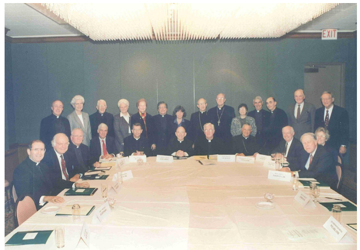
Inaugural meeting of the Catholic Common Ground Project at the Sheraton Hotel, Chicago, IL, October 24, 1996.