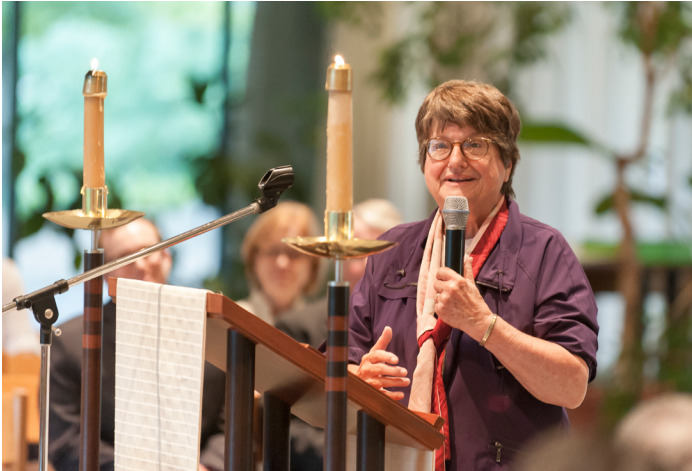
Sr. Helen Prejean, CSJ receives the Cardinal Bernardin Award on June 24, 2016.

Visit www.catholiccommonground.org to receive this newsletter via email.